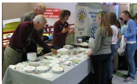
SACP members perform chemistry demonstrations during National Chemistry Week at the Carnegie Science Center.