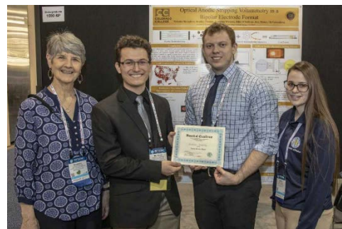
A former SACP Student Affiliates President (right) presents the James A. Manner Award to an outstanding undergraduate poster presenter at PITTCON.