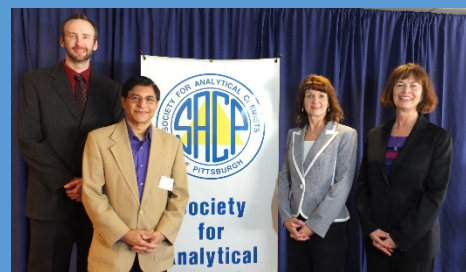
2018-2019 SACP Executive Committee